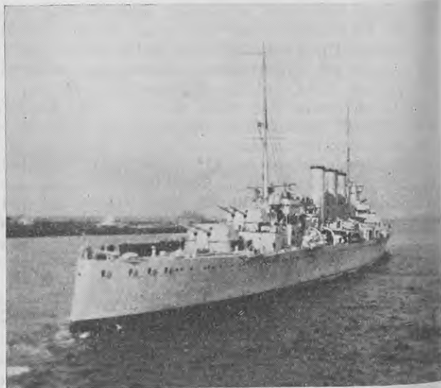
H. M. S. ???

It is interesting to note that he has held every rank including that of W. O., in his old regiment.