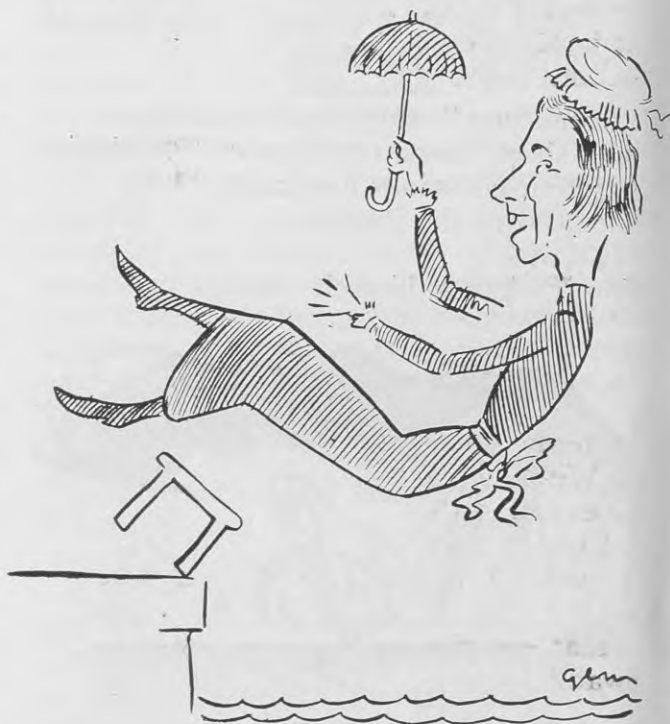
A lady at the bath