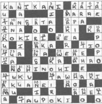
Solution to Crossword No. 1