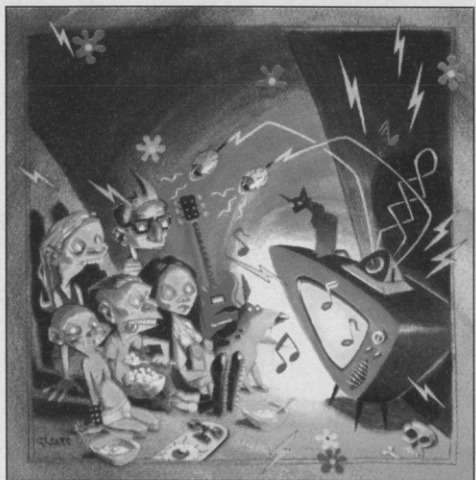
In January, an alternative compilation Saturday Morning mates various artists with the themes from kids TV shows. Coolest include Matthew Sweet with 'Scooby Doo Where Are You?' and Liz Phair with 'The Tra La La Song (One Banana, Two Banana)'. Other bands include Frente!, the Ramones, Helmet and Violent Femmes.