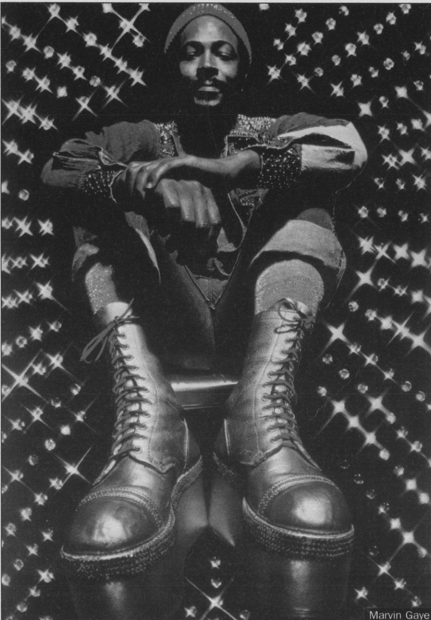
There's a Marvin Gaye tribute album Inner City Blues near at hand with contributions by Bono, Nona Gaye, Stevie Wonder, Boyz II Men, and Madonna with Massive Attack. Pictured here is Marvin on the cover of his 1974 live album where he called his selection of his 60s hits a "Fossil Medley".