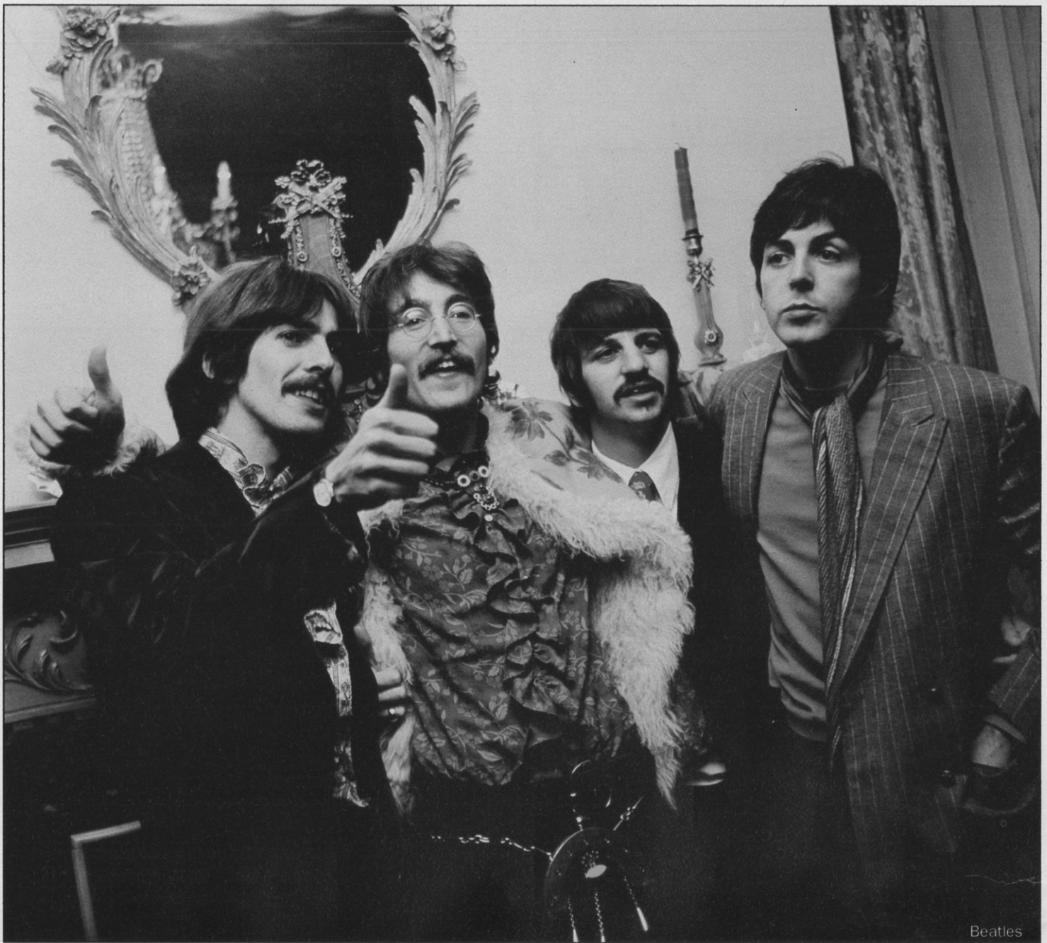
With their Anthology 1 rarities compilation in stores, the Beatles feature on TV1 the next two Mondays December 4 and 11 when their six hour documentary screens. In the UK the Beatles insisted that advertising for meat, alcohol, and tobacco, could not appear during the series. An upset spokeswoman for Walls Sausages told NME , "Our sausages are fantastic. They're very popular throughout the country."