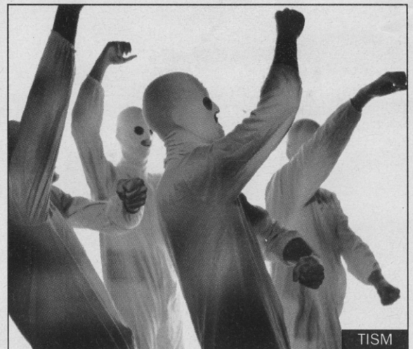
This year's sickest song title could be '(He'll Never Be An) Ol' Man River', taken from Australian band TISM's EP I'm On The Drug That Killed River Phoenix . TISM, who are wacky, and who have an album Machiavelli And The Four Seasons , are at Auckland's Big Day Out this summer.