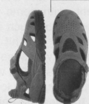
All Terrain Machine

You need breather vents : because bad smells are not things to collect.