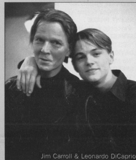
Jim Carroll & Leonardo DiCaprio

Liz Hurley will join Leslie Nielsen for the action spoof Spy Hard ... the 'it' girl of the moment, Sandra Bullock , has just finished filming Two if by the Sea with 'Asshole' man Denis Leary . She has also signed on for A Time to Kill ... following the recently completed Beyond Rangoon , Patricia Arquette will play an English woman in The Secret Agent , based on the book by Joseph Conrad and co-starring Gerard Depardieu , Bob Hoskins and Robin Williams ; the wife of physicist Richard Fienman, who helped create the atom bomb, in Matthew Broderick's directorial debut, Infinity (Broderick also co-stars); and take a place in Spanking the Monkey director David Russell's forthcoming farce, Flirting With Disaster , which co-stars Ben Stiller , Mary Tyler-Moore , George Segal and Lily Tomlin ... Spike Lee's newest film, Girl 6 , stars Theresa Randle , Madonna , Quentin Tarantino , Debi Mazar , Naomi Campbell , Richard Belzer , Peter Berg , Halle Berry and the director himself ... Clive Barker's new film is Lord of Illusions , starring Scott Bakula .