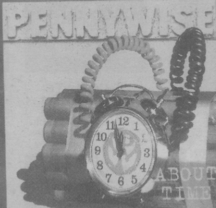
PENNYWISE "About Time" featuring the single 'Same Old Story'.