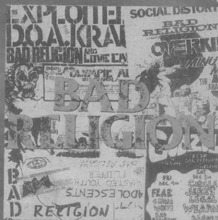
BAD RELIGION "All Ages" The best of Bad Religion including unreleased live tracks.

AND the OFFSPRING'S very first album "Offspring" now available in NZ for the first time!