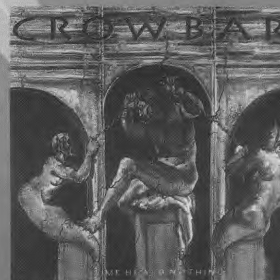
CROWBAR Time Heals Nothing

JPS Experience songwriter Dave Mulcahy is back with a new trio, Superette. This debut on Flying Nun contains five sweetly spare pop songs mixing grand hook riffery and sly tunes to maximum effect. Major groovy lead-off track 'Killer Clown' appears on TV screens and seven inch singles too.