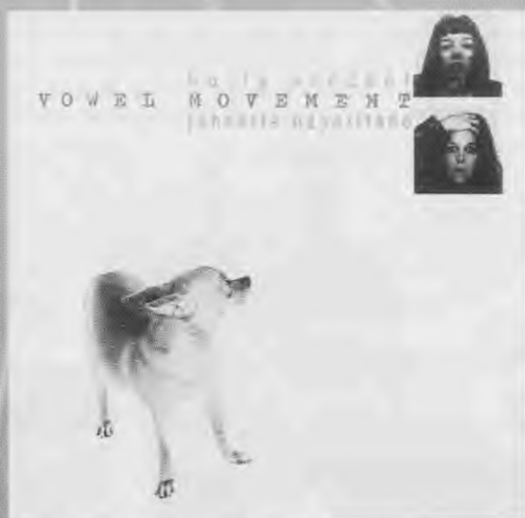
VOWEL MOVEMENT Holly Vincent Johnette Napolitano

Holly Vincent (ex Holly & The Italians) and Johnette Napolitano (ex Concrete Blonde) make up the duo that is Vowel Movement. Holly and Johnette formed the band on New Year's Eve in 1993 when neither of them had a date. They drank, smoked pot, did each other's tarot cards, threw the I-Ching, drank some more, Johnette picked up her bass, Holly got on her drums, Johnette started mumbling...and vowel movement was born. Johnette and Holly played and sang everything on the album which was recorded in six days. If it weren't for Johnette and Holly, it would be safe to say that there wouldn't be people like Liz Phair, Bikini Kill, Seven Year Bitch & Hole around, OK?