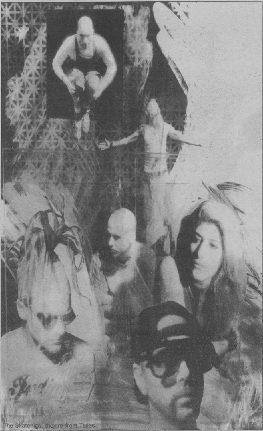
The Skatenigs, they're from Texas.