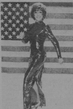
Hoffman as Dorothy

TOOTSIE Director: Sydney Pollack I experienced quite a frisson when the Golden Globes Best Actor and Actress awards were given to performers who had crossed genders in their particular films. One of course was Julie Andrews in Blake Edwards' dazzling Victor/Victoria and the other was Dustin Hoffman in Sydney Pollack's Tootsie . Hoffman's character, like Andrews', is an out-of-work performer who finds that he is able to gain employment by cross-