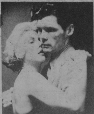
Deborah Harry & Pat Benatar in 'Union City'.