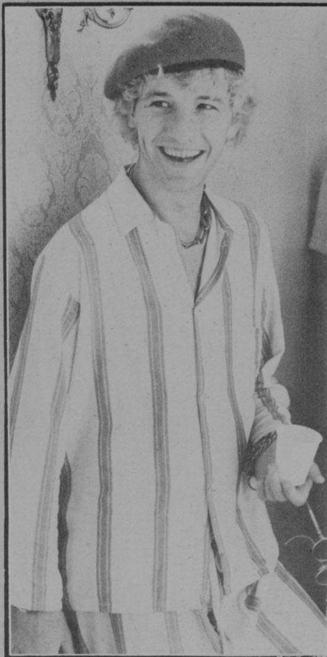
Captain Sensible shows that old punks never lose their style, even under pressure from a hit single. 'Happy Talk' is currently playing on Radio 1. His album is entitled Women and Captains First . He is currently touring with The Damned, and is planning solo gigs in December with his own band.