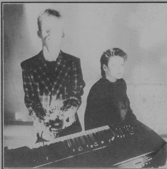
Vince Clarke (left) and Alison Genevieve Moyet, affectionately known as Alf, are YAZOO whose 'Only You' is one good reason to turn on the radio. Their new single, 'Don't Go' and debut album Upstairs At Eric's , are on the way, Vince plays synth, Alf sings.