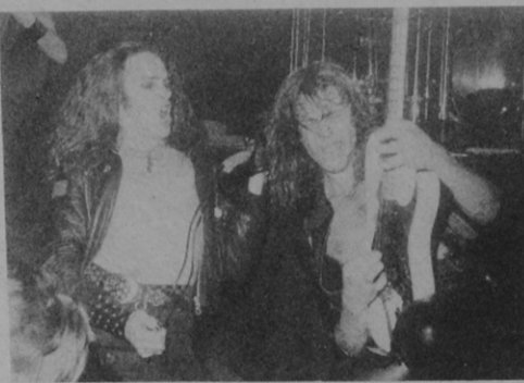
Rose Bayonet, Gluepot.