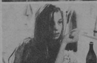
Bowie, Natja Brunckhorst.

with another man. Chief players Harry Hamlin, Michael Ontkean, and Kate Jackson. Out late June.