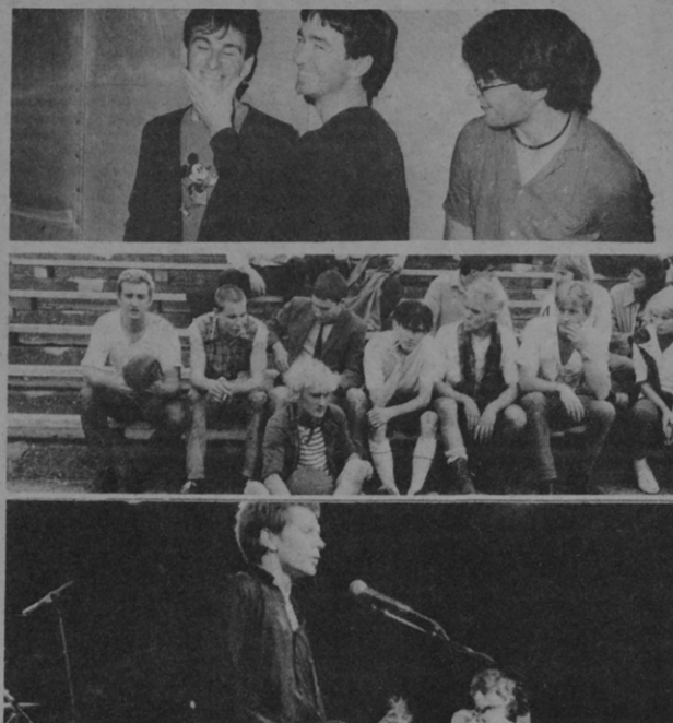
Top Blind Date (45 soon). Mid pic is Meemees' rep soccer team. Other pic is Flowers at Sweetwaters.