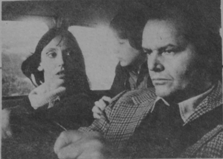
Wendy (Shelly Duvall) looks for signs of craziness to come from Jack (Jack Nicholson) while Danny seems to be 'Shining' in the back seat.