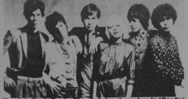
Yes, it is Davie Bowie. Blondie being themselves in 'Roadie'.