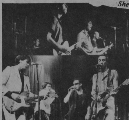
SHEERLUX THE GLUEPOT, MARCH 13.

Six months ago, Sheerlux were probably the fastest-rising local band. Yet, even then, if you drew up a list of the band's assets and liabilities, they were strikingly similar.