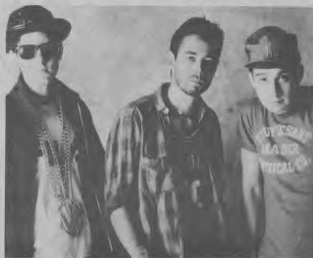
Beastie Boys (L-R) Mike D, MCA, King Ad-Rock.