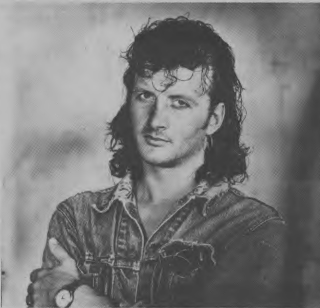
Mental as Anything's Martin Plaza.

"We've released 'Best Foot Forward' and that's starting to take off but my personal favourite is 'Use Me All Over' and that will be the next single over here. It would be very satisfying for me if that was a hit because that is the best vocal performance on the record."