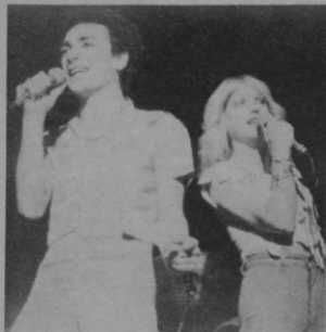
Sharon O'Neill joins Mark Williams on stage, June 1977.

Tours: Commodores, Renee Geyer, Joe Cocker, Split Enz, Manhattan Transfer, Tina Turner Revue, Janis Ian, Fleetwood Mac, Hello Sailor (Rum & Coke Tour), Lou Reed.