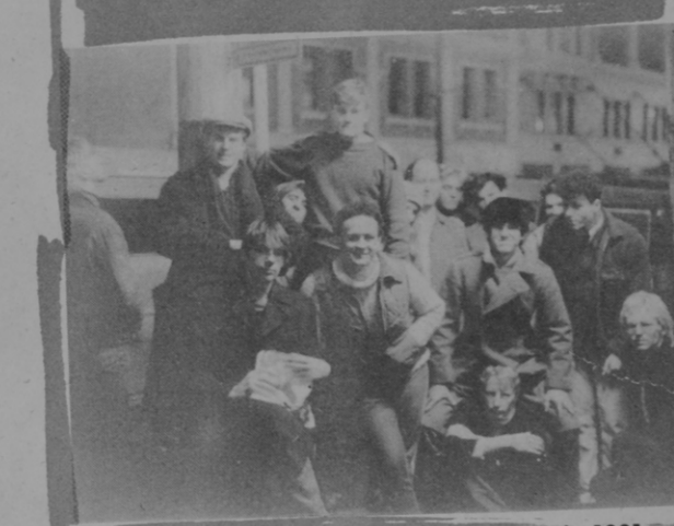
Screaming Blamatics tour about to depart July 1981.