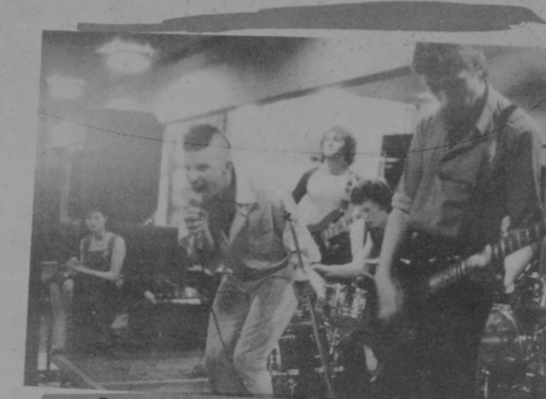
Enemy play Auckland Uni, Oct 1978.

'Poi-E', Patea Maori Club: All that aroha and you can't stop dancing. 'Long Ago', Herbs: The best harmony singing on the sweetest tune.