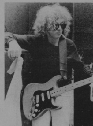
Dave Dobbyn at Devonport outdoor gig, late '81.