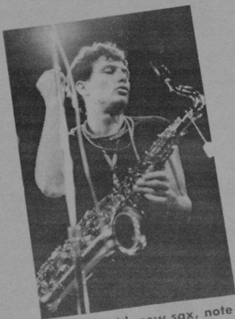
Brazier with new sax, note price tag, May 1978.