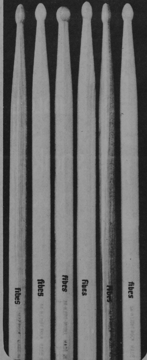
Fibes Fibes Fibes Fibes Fibes