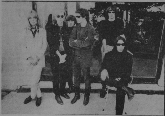
Velvet Underground and Andy Warhol, 1966.