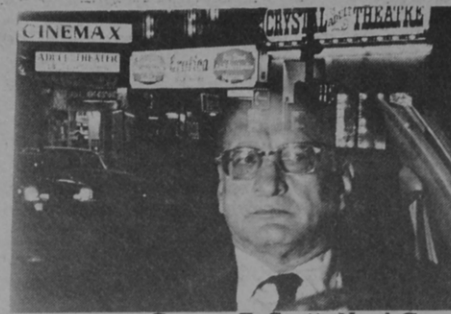
George C. Scott, Hard Core .