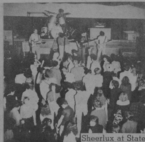
Sheerlux at State