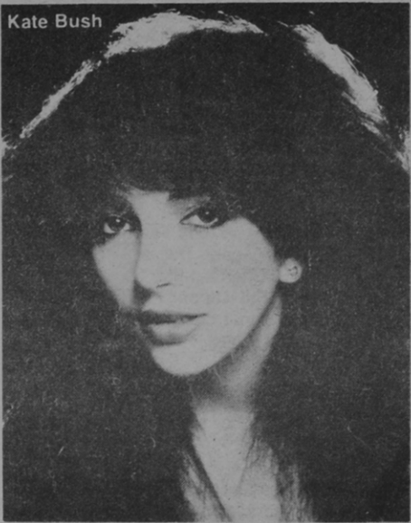
Kate Bush Lionheart EMI

Kate Bush is the latest in a long line of unusual vocal stylists (no-one has commented how similar her style is to that of Linda Lewis) and the new album shows explorations of new territory only hinted at in the first album, The Kick Inside .