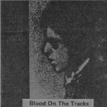
Blood On The Tracks

Includes Hurricane, Mozambique, Black Diamond Bay, Romance in Durango.