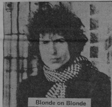
Blonde on Blonde

Includes Rainy Day Women, I Want You, Just Like a Woman, Sad Eyed Lady of the Lowlands.