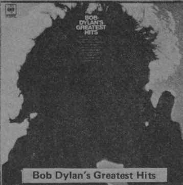
Bob Dylan's Greatest Hits

Includes Knocking On Heaven's Door, Cantina Theme, Turkey-Chase.