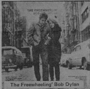
The Freewheelin' Bob Dylan

Includes Rainy Day Women, I Want You, Just Like a Woman, Sad Eyed Lady of the Lowlands.