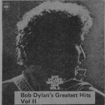
Bob Dylan's Greatest Hits Vol II

Includes Positively 4th Street, She Belongs To Me, My Back Pages, Man of Constant Sorrow.