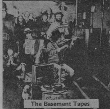
The Basement Tapes

Includes Tangled Up In Blue, Shelter From the Storm, Simple Twist of Fate, You're a Big Girl Now