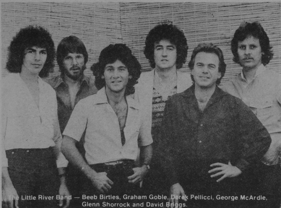
The Little River Band — Beeb Birtles, Graham Goble, Derek Pellicci, George McArdle, Glenn Shorrock and David Briggs.