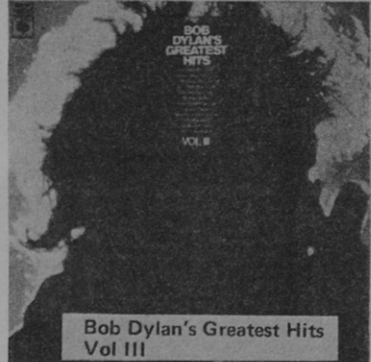
Bob Dylan's Greatest Hits Vol III

Includes This Wheel's On Fire, Goin' to Acapulco, Million Dollar Bash, Long Distance Operator.