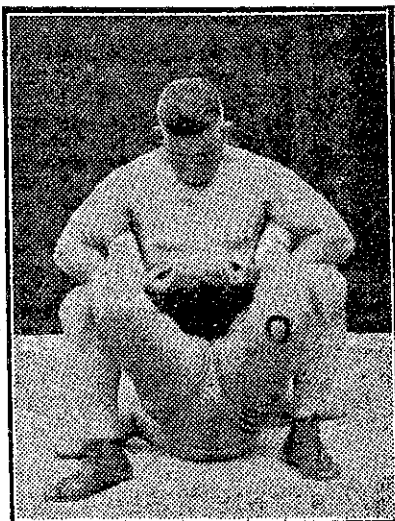
• THE CRAB HOLD •

a prominent Scot and an elocutionist of rank in the Dominion. He will talk on "Elocution and Speech Over 50 Years."