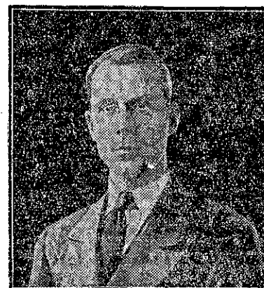
The Man who has revitalised thousands of neurasthenic cases.

Various aspects of the work at the children's sessions were discussed and suggestions made.