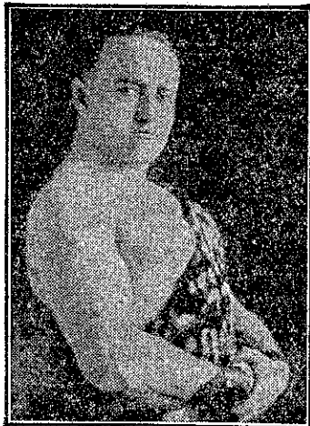
BRITON—MAKER OF MEN