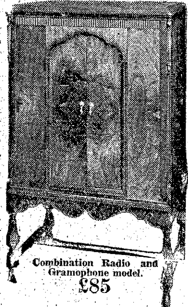
Combination Radio and Gramophone model. £85

are the two major points which potential radio receiver owners must consider. Gulbransen has REPRODUCTION because it is necessary that a receiver should be able to tune in all broadcast stations within a given range and TONE, well, just listen to a "Gulbransen," either combination or a straight radio model, and hear the beautifully-toned dynamic speaker, giving each note its full chromatic value, and then you will understand why hundreds have chosen the "Gulbransen."