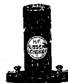
Lissen H.F. and L.F. Chokes. Price .... 7/6 each