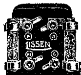
Lissen R.C.C. Unit. Price ..... 6/9