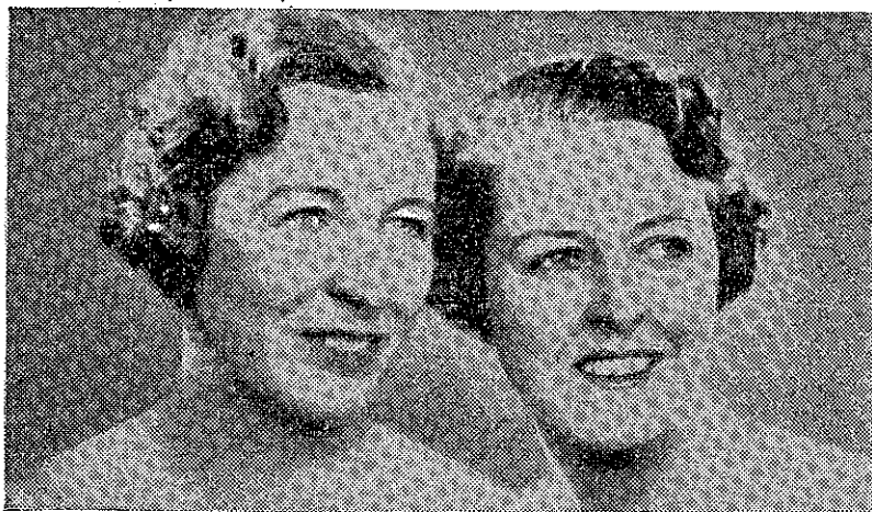
Here are "Gert and Daisy"—otherwise Elsie and Doris Waters, the popular English broadcast stars, who will be heard in some brand-new recordings during a "Radio Matinee" from 2BL, Sydney, on Thursday, February 7. These numbers may be heard in New Zealand at 5.39 p.m. (N.Z.S.T.) on the day mentioned above.