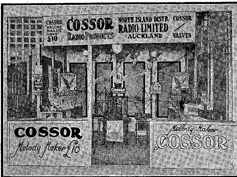
Radio Ltd's stand at the Olympia.