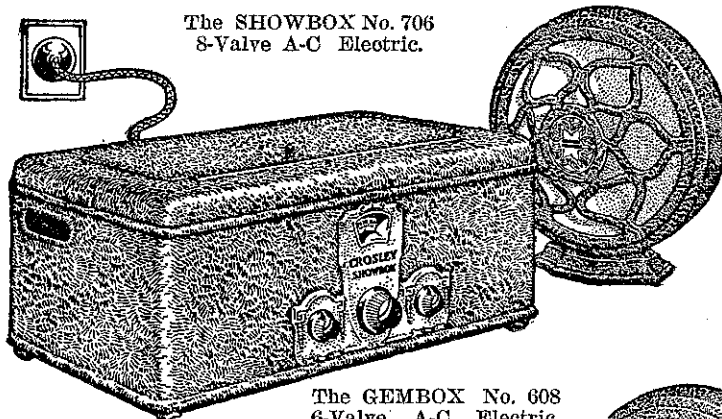
The SHOWBOX No. 706 8-Valve A-C Electric.

Simplicity of design is the keynote of the Showbox. A completely shielded genuine neutrodyne (patented) Receiver, with three stages of radio frequency amplification, detector, and using the famous "push-pull" hook-up which produces immense volume without distortion. The Showbox utilizes full 180 volts on the plates of the output valves, and is by all odds one of the most finely made and efficient A-C Sets ever offered to the Radio public. With the Crosley Dynacone (Dynamic) the Showbox is a revelation in fidelity of reproduction, as is known to-day, only where most expensive Sets are operated. It operates from the house current. Its handsome gold highlight, ripple-finish metal cabinet will be appreciated by all lovers of the artistic.