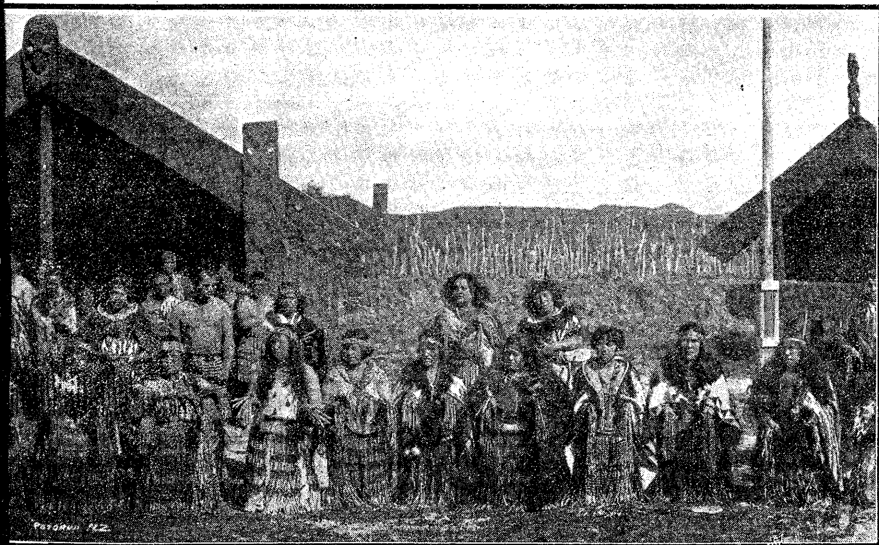
OF THE MAORI MAIDENS AND THE RAUPO "POIS," THE MANIPULATION OF WHICH IS SUCH A FEATURE DANCE.