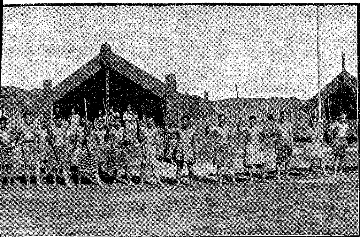
LINE FOR THE HAKA OF WELCOME