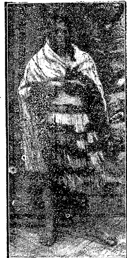
OPE WHANARERE.

ROYD'S MOTORS LTD. CHRISTCHURCH, South Island Distributors.