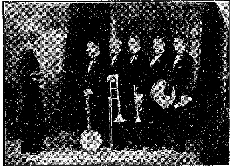
Dixieland "Internationals," famous for dance music. On the air, Saturday, 1YA.