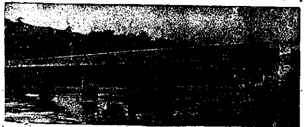
Victoria Bridge, Moonshine, Upper Hutt.