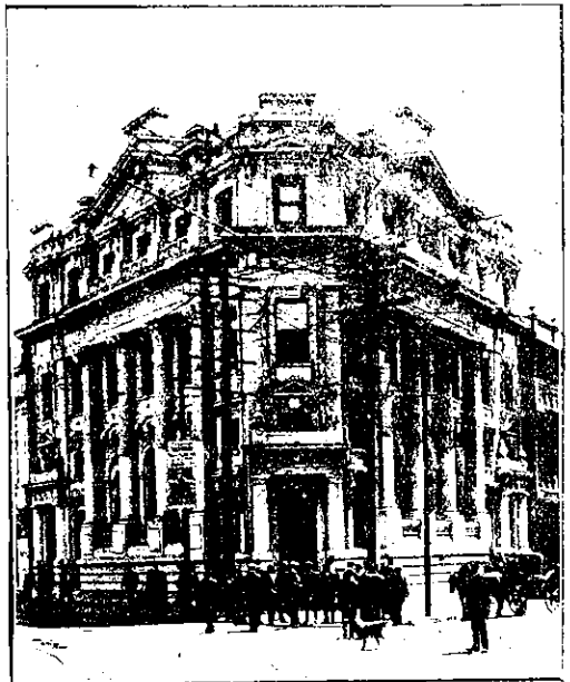
Bank of N.Z., Manners St., Wellington. Built with Golden Bay Cement.