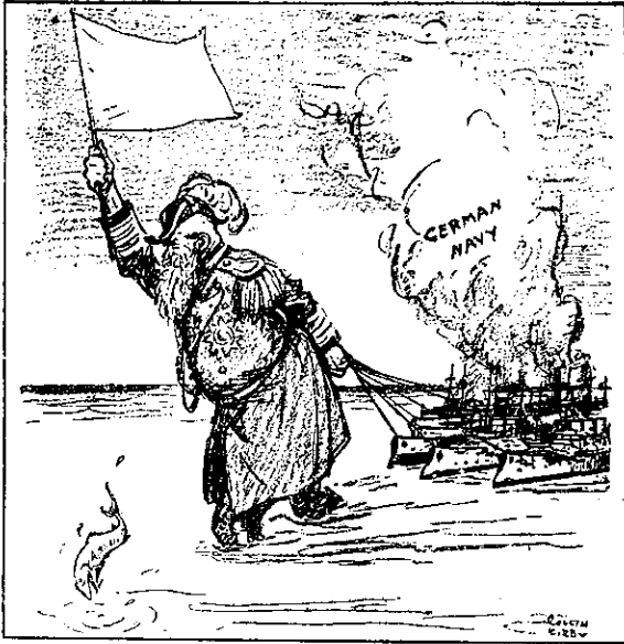
"Out at last."