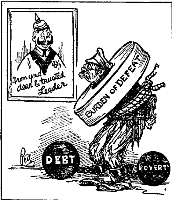
"Love Him? Well, wouldn't you?"