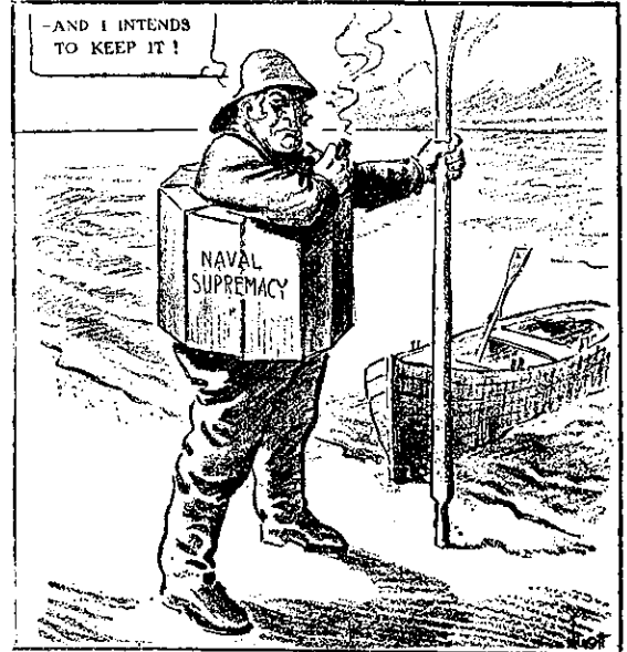
"His good old Life Preserver."