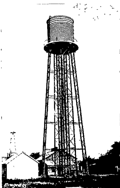
HIGH-PRESSURE WATER-SUPPLY TOWER ERECTED BY LUCAS BROS. CHRISTCHURCH, FOR THE BOROUGH OF SYDENHAM.