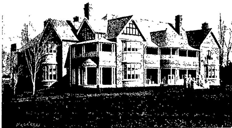
NEW RESIDENCE OF A CHRISTCHURCH MERCHANT, RICCARTON ROAD, CHRISTCHURCH.