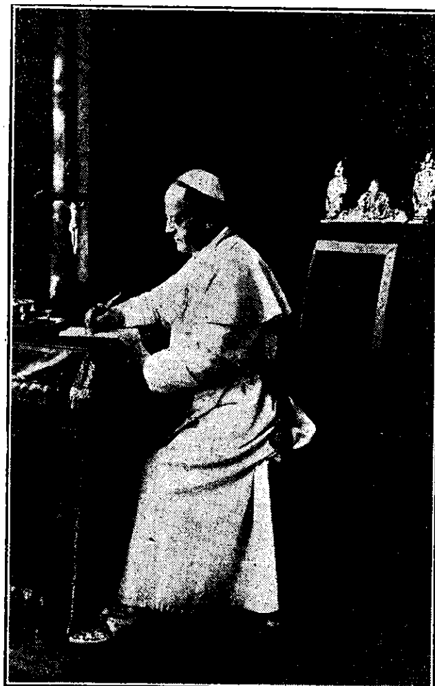
THE POPE IN HIS STUDY.