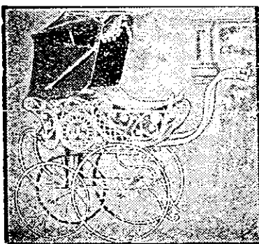
THE LATEST HYGIENIC HOOD.