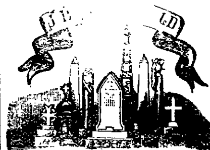
MANCHESTER STREET SOUTH, Near Railway Station, CHRISTCHURCH.