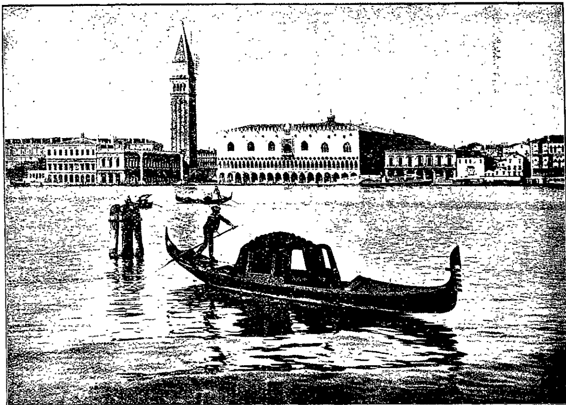
THE 'MOLE' OF VENICE, as seen from St. George's.