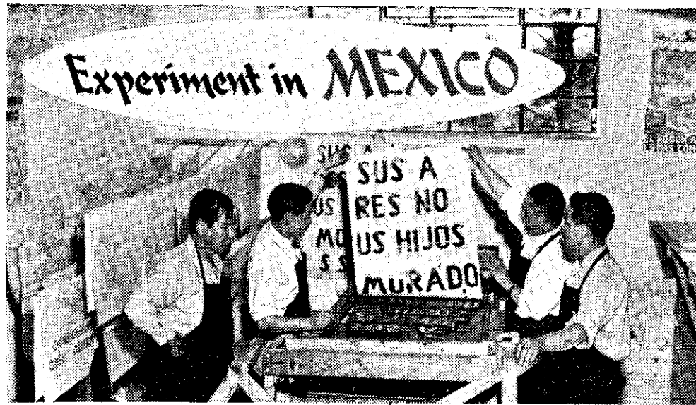
LEFT: Producing cheap instructional posters from wax blocks as part of the Patzcuaro experiment in fundamental education.