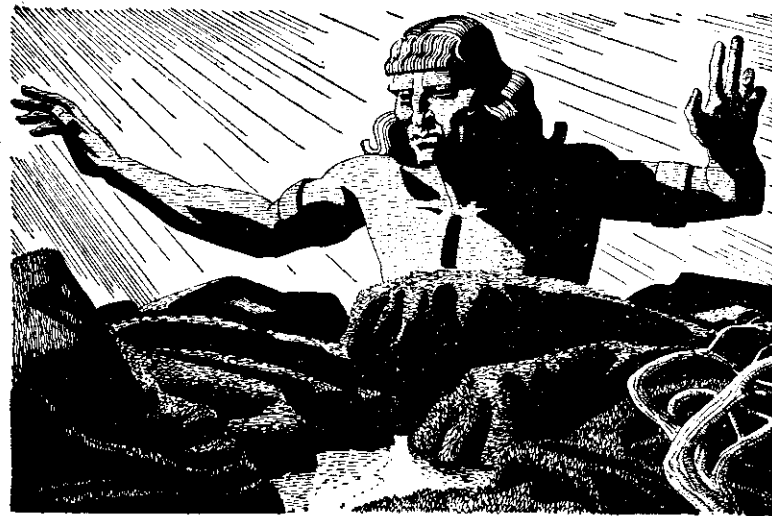
"WIDESPREAD they stand, the Northland's dusky forests, ancient, mysterious, brooding savage dreams"—the Sibelius tone poem "Tapiola" will be broadcast from 4ZB this morning at 9.45